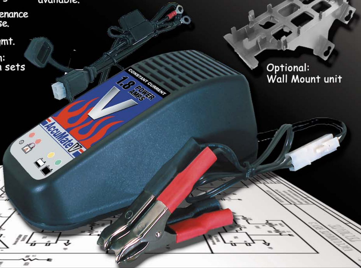
Optional: Wall Mount unit

- Recharges most flat batteries down to 2V - Better than normal chargers.